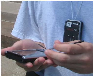
Figure 3: Dell Axim & GPS Receiver

As the students move around a physical location, such as their school playground or sports fields, a map on their handheld displays digital objects and virtual people who exist in an augmented reality world superimposed on real space (see figures 3, 4, & 5).